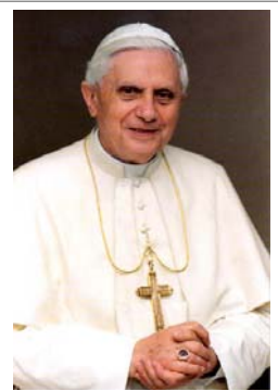
Pope Benedict XVI